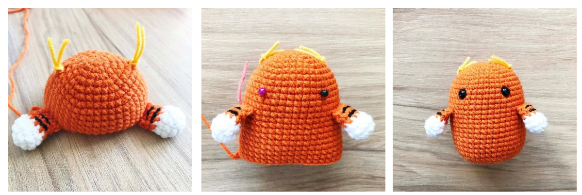
Rounds 15-23: 9 rnds total - 1 sc each into every st. (42)

Round 14: 4 sc – through both sets of sts from body and paw at the same time, too, 11 sc, 4 sc – through both sets of sts from body and paw at the same time, too, 23 sc (42)